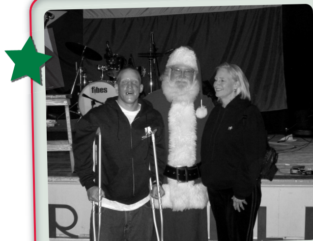
During the last Christmas Season, Coalition donors provided $50,000 in Secret Santa Christmas gift checks to severely injured servicemen and women across the country. Our wounded heroes used their $500 to provide Christmas presents for their families and pay for food and other necessities.