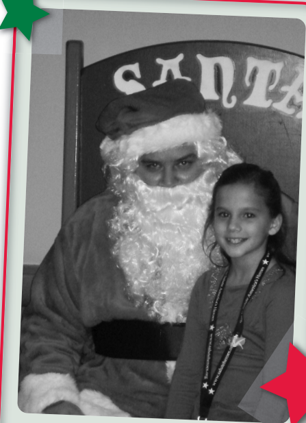
Coalition donors have made thousands of Christmas dreams come true for children whose parents have been wounded while serving our country.