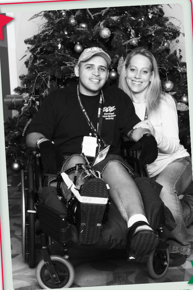
Sending Christmas wishes to a serviceman or woman who is wheelchair-bound is a great way to let that hero know you appreciate the sacrifice he or she made and are proud of his or her service to our great country.